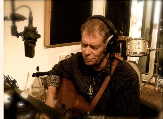
in the recording studio

It's been an exciting few months especially as the new album Something for the Soul and a new book Occupied Territories have both come out. We hadn't anticipated they would arrive at the same time but it is serendipitous as in many ways Something for the Soul is the soundtrack of Occupied Territories .