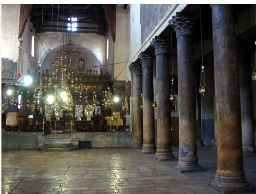
Inside the Church of the Nativity, Bethlehem - where 'One of Us' was written, and also a few years later, 'Bethlehem is Calling'