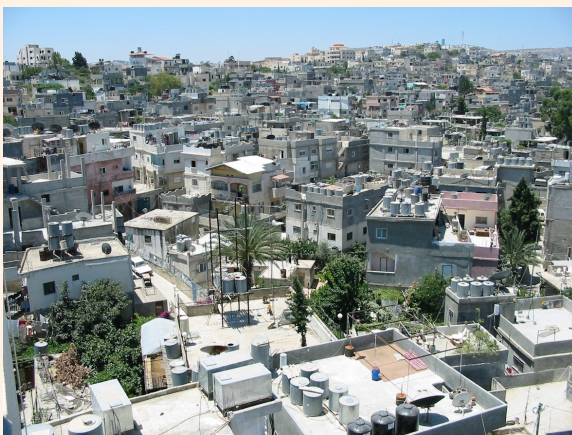
Looking across Bethlehem from Dheisheh Refugee Camp

As our thoughts go to Bethlehem at this time of year, Palestine is being mistreated once again. Why is there no equality or justice for the Palestinian people? The Christians of Palestine - Kairos Palestine - have issued a Christmas Alert and it is very good material to bring into our church services and into our personal thoughts and prayers during this time of Advent and Christmas. You can download it