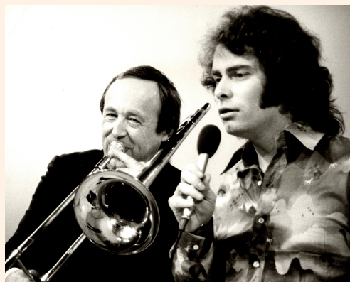
with Chris Barber

Also in 1974 I recorded a track with the Chris Barber Jazz and Blues Band, called I Will Return , a joyful piece of traditional jazz that later led into a TV programme that we did together one Good Friday, called "The Reason and the Rhyme".