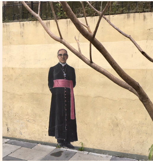
Archbishop Oscar Romero of San Salvador

As my tribute to Oscar Romero I put the song on youtube here .