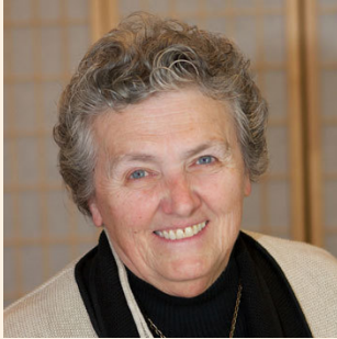
Sister Joan Chittister