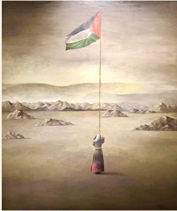
'Voice in the Wilderness', painting by Suleiman Mansour