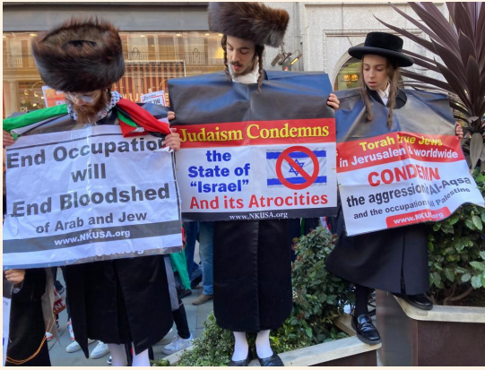
Anti-Zionist Orthodox Jews, members of Neturei Karta, Jews United Against Zionism, at last weekend's demonstration in London

Many Jewish voices calling for peace and an end to the occupation go unheard by the media